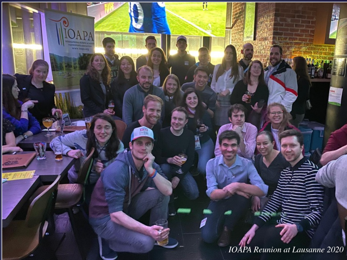
IOAPA Reunion at Lausanne 2020