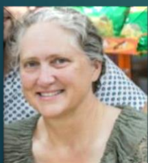
Written by: Heather L. Reid , USA.

So take the wings of eagles, your athletes’ famous strength, And like your temple’s columns, bear this heavy weight. Straighten up your back, and raise your head with pride, Embrace again sweet Virtue; your sister and your child!