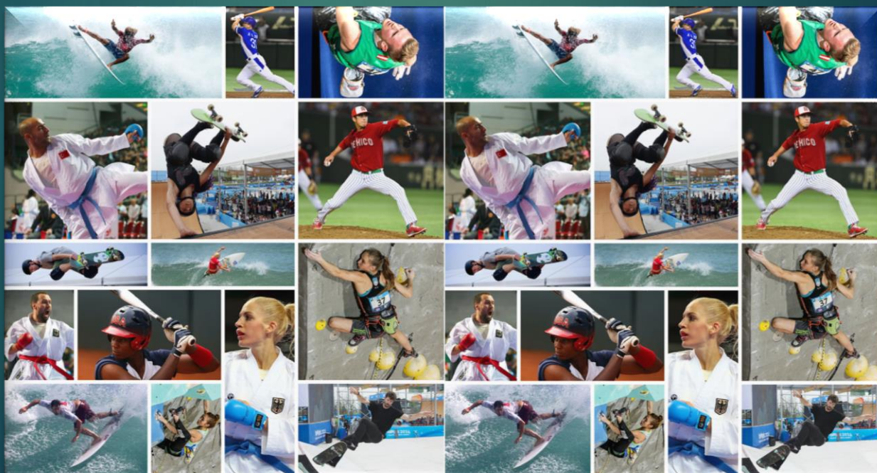
FIVE NEW SPORTS FOR OLYMPIC GAMES TOKYO 2020.

The actions of female athletes and officials constantly pushed for integration of women into the Olympic Movement. Today, the gender gap is closing for female athletes participating in the Games, but there are still a lot of challenges for women in integrating to the higher spheres of sports management. Up to today, there has not been a single woman that has directed any Olympic Organizing Committee and there are still gendered divisions of labor. This is reflected in how both Olympic governing bodies and Organizing Committees have hired few women as heads of departments or areas, and still there has not been a woman elected as IOC President.