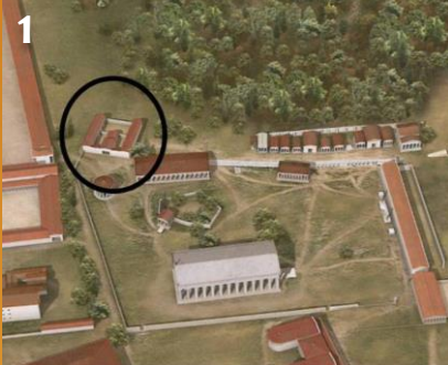
North and western corner of the Sanctuary of Zeus in Olympia. 6-5 th cent, BCE.