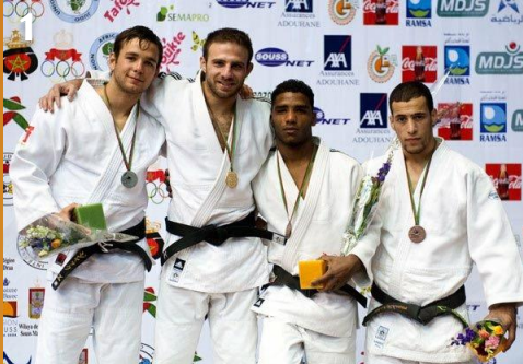
Image 2: Hussein during his 2 nd match at London Olympic Games 2012.