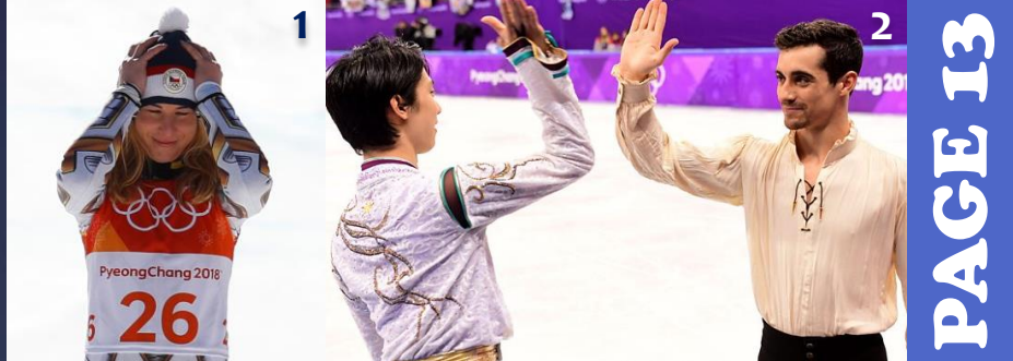
Image 2: Yuzuru Hanyu (L) and Javier Fernandez (R) high-fiving.

Image 1: Snowboarder Ester Ledecka, of the Czech Republic, wins Super-G Olympic skiing gold.