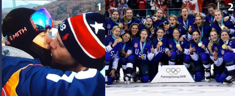
Image 2: U.S. women's hockey players celebrate after receiving their gold medals.

In fact, arguably, any Winter Games – with a supreme victory, which became her the first athlete to claim gold in two different sports at the same Winter Games. She is an inspiration even to those who do plenty of inspiring.