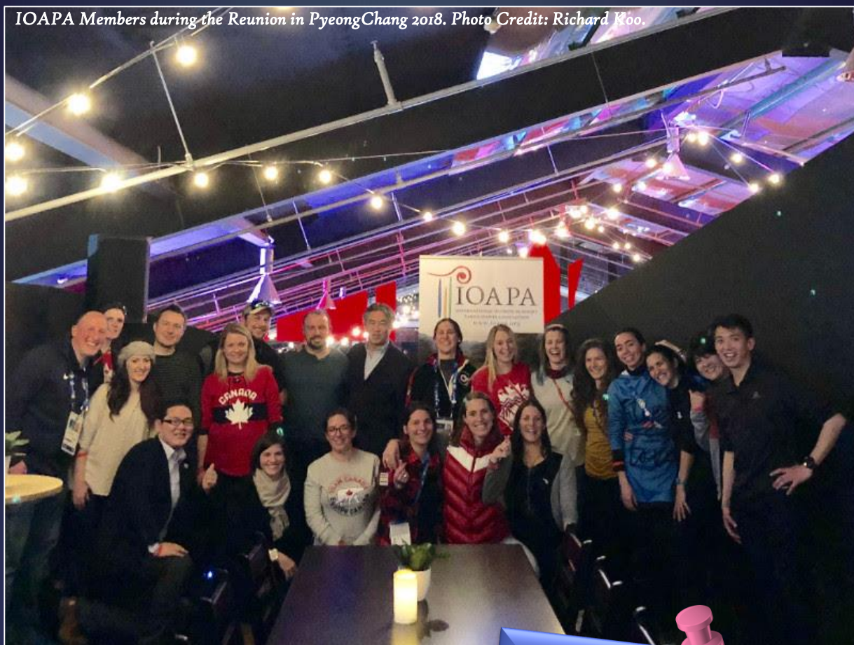
IOAPA Members during the Reunion in PyeongChang 2018.

The Olympic Games are not able to force peace, a supreme gift to which all aspire, but in the youth of the entire world brought together is the opportunity to find that all men of the earth are brothers.