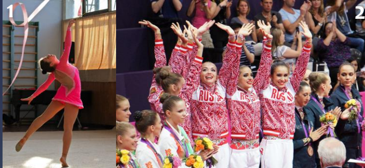
Image 2: Russian national team wins gold medal at London 2012 Summer Olympics.

are real role models for many Russian girls. Such a high popularity of gymnastics in Russia creates an intense rivalry, especially in Moscow. A lot of athletes that represent different countries on the international level compete in Moscow championships. It is favorable for reaching high achievements, nevertheless, it creates a serious problem for the development of gymnastics as an amateur sport. Today rhythmic gymnastics in Russia is a professional sport, so the majority of girls give up gymnastics at the age of 15-17 years. In order to compete even on the average level (regional competitions), it is necessary to have a minimum of 5-6 trainings of 3-5 hours each week. However, a few years ago amateur gymnastics started to develop in Russia.