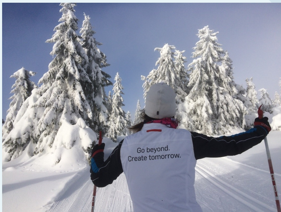
Nice ski tracs around Lillehammer during the games.

In the end, it's impressive to see all of the young people involved in this event. Out of a total number of 3170 volunteers, 800 were under 20 year. There were more than 300 cultural events during the week, and all the entertainers were younger than 30 years old. Many key persons in the organization were young, but they were well supported by more experienced persons with hands on experience from the Olympics in 1994. The education and development of young people in connection to Lillehammer 2016 was an important part of the legacy. Lillehammer 2016 wasn't only a learning area for the future athletes, but also for the coming leaders, coaches and volunteers. All this in blissful harmony with the slogan for the games; GO BEYOND, CREATE TOMORROW.