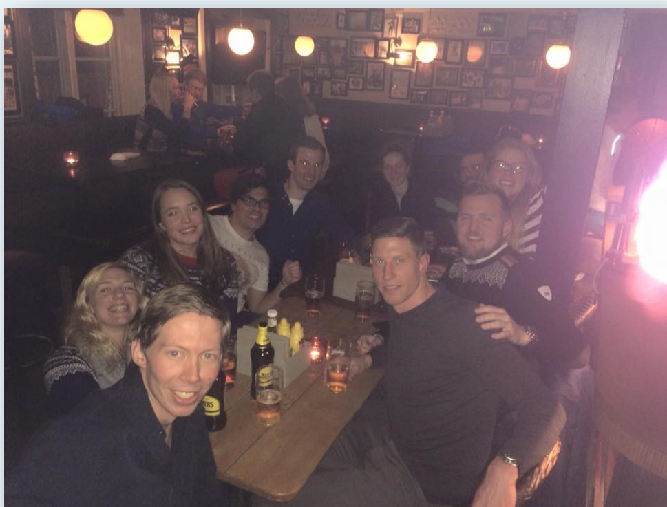
Former participants at the IOA together at the local sports bar in Lillehammer

Another great thing with Lillehammer 2016 was all the people that came to visit us. And even greater, many of them had been participants at the International Session for Young Participants in Olympia. We had some evenings during the week where former Norwegian IOA participants arranged gatherings for other IOA participants. In addition to meeting my friends from the IOA 2015, I also got to know participants that had attended the academy earlier. It was so cool to see everyone again, and exchange ideas the same way that we did in Olympia.