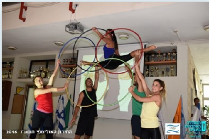
The gymnastics team at the end of the show

The best part of the Olympic Quiz, and without a doubt the most meaningful one, was that everyone who was involved in the event, whether actively or passively, got a chance to think and understand the meaning of the Olympic Games: that the most important thing is not winning or losing, but the knowledge and ability to play the game fairly, an essence that can serve us in our daily lives, making it the true prize!