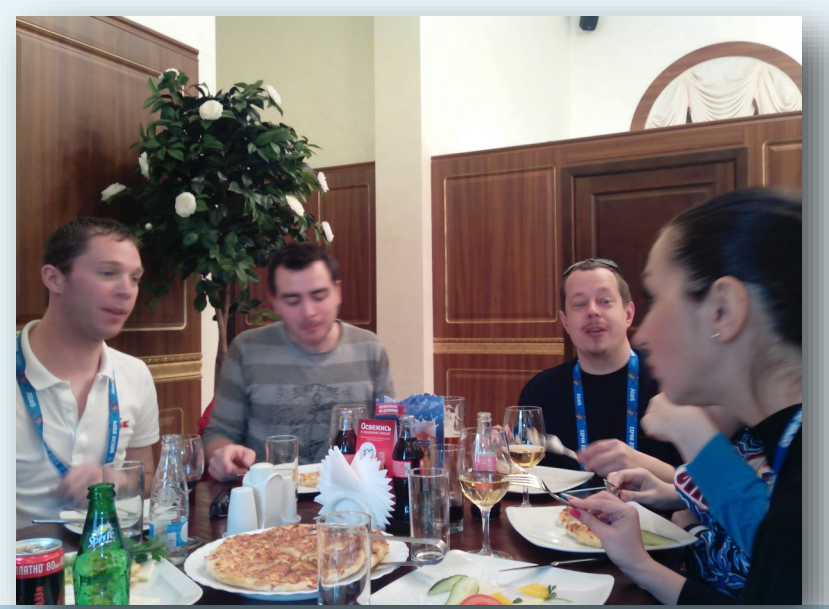
WWW.IOAPA.ORG - ARETE NEWSLETTER- SPRING 2014 ISSUE

The place was actually an old train station building – very easy to reach by train 'Lastochka' or by accredited bus from any Olympic venue (Olympic Park, Mountain Cluster, Olympic Village, Volunteer Village) as well as from other Sochi districts. By entering old building and seeing new innovative Adler train station on the right hand everyone can understand well how much Sochi has been improved thanks to the Games and how many enormous projects and things have been done so far in the Olympic city and wider area.