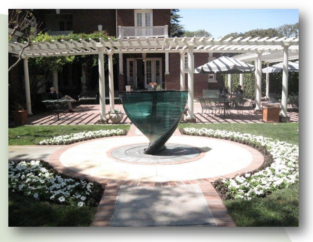
Olympic Flame at LA84

Here are some suggestions and comments for future.