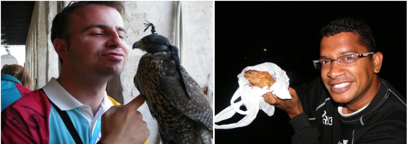
IOAPA President MUST love animals!!