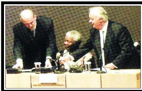
Former President, Nelson Mandela, signed the agreement, supporting the Olympic Truce Initiative on 19 June 2002 in Athens. www.olympictruce.org