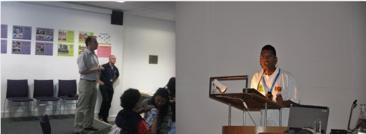
Past & Present IOAPA President in moments of leadership!