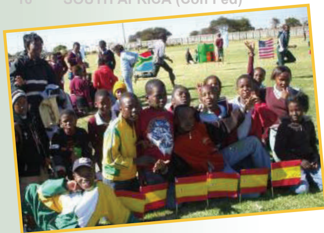
Team Representing Spain