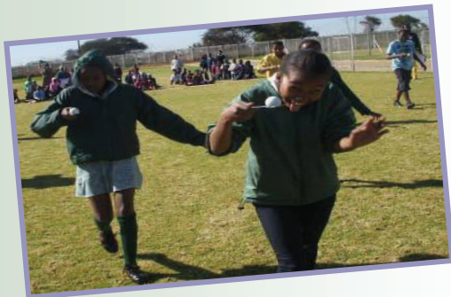
Egg and Spoon Race