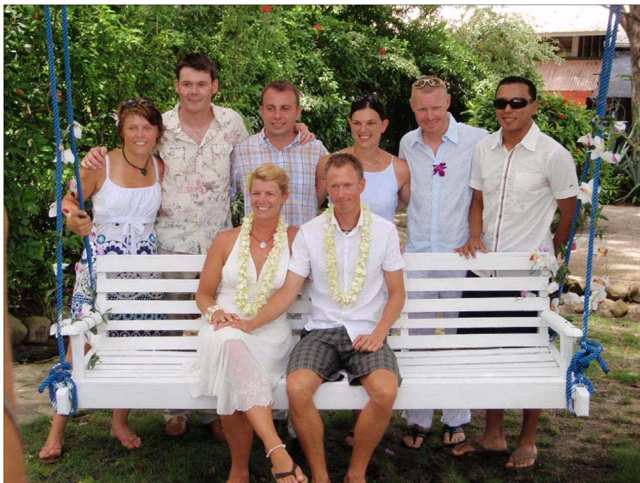
IOAPA members at the wedding party in Costa Rica:

We have moved to Costa Rica and established Bahia Rica Adventures. This is a tourist business with sports fishing, kayaking, snorkeling, boat tours and jungle walks. We are based in a small community and are only using local labor. We are at the moment working on a cooperation with the Costa Rican football league, to assist with a development initiative.