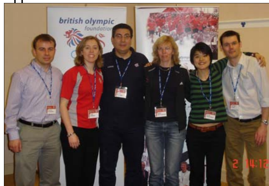
IOAPA members attending the 2008 BOA

It is also good to note that the IOAPA was well represented during this seminar and the members of the IOAPA Executive Board that were present at the seminar took the opportunity to discuss various topics in connection with the IOAPA. It is an exciting and interesting phase for the IOAPA that is reaching new heights by the sheer determination of the hard working Executive Board that was elected at the last IOAPA session in Olympia in summer 2007. Let's keep the IOAPA alive and kicking and let's spread the Olympic spirit as far as we can. The more we work within the Olympic family the better it makes us feel within.