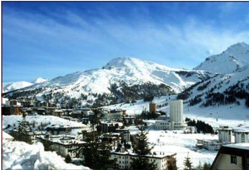
A view of Sestriere, Turin

That during the XX Olympic Winter Games to be held in Torino (ITA) from 10-26 February, 2006, 2.500 athletes and 2.500 officials from 85 National Olympic Committees will be housed in three Olympic Villages: Torino, Bardonecchia, and Sestriere?