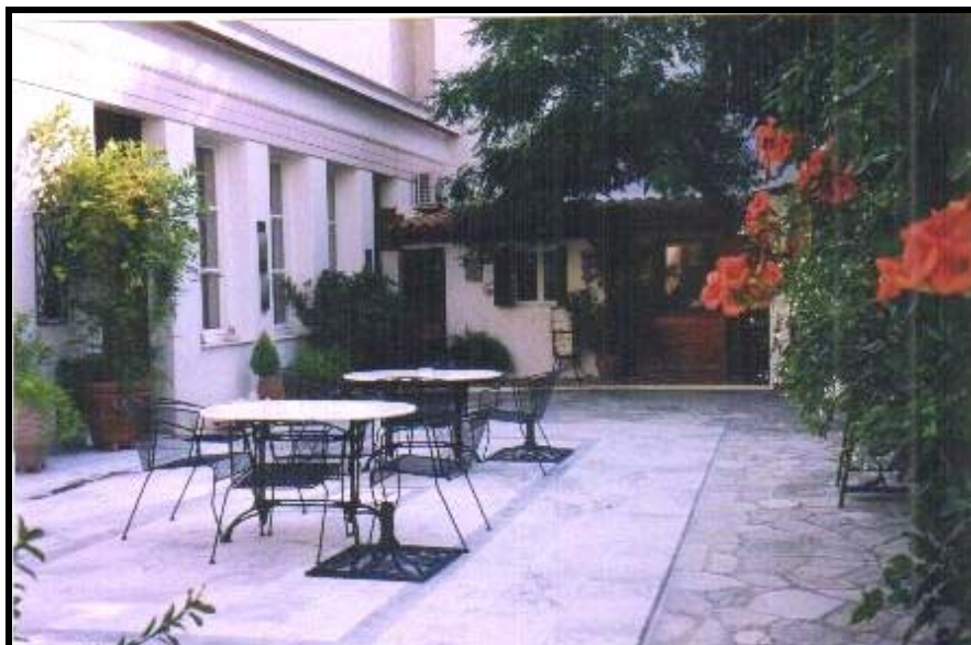
View of the Athens Centre, a conveniently located venue for the reunion

WHERE? The Athens Centre, Archimidous Street in Mets (just behind the 1896 Olympic Stadium ~ directions to follow later)