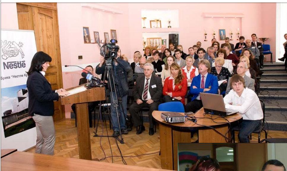
The presentation of my paper at Conference in auditorium of Kuban State Physical Education, Sport and Tourism University, 161 Budennogo Street, Krasnodar (Russia).