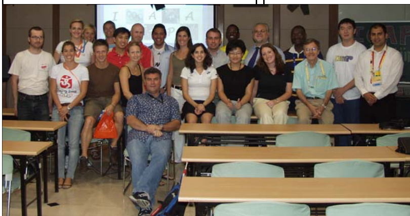
IOAPA Reunion participants at Beijing High School #4, Lecture Hall.

These meetings at the Olympic Games, are very beneficial. On the one hand, you see all your old friends from Olympia, and on the other, you meet many new people that make your friendship network even bigger, which is very important for many of us. All I can say – Let's keep the spirit moving on!