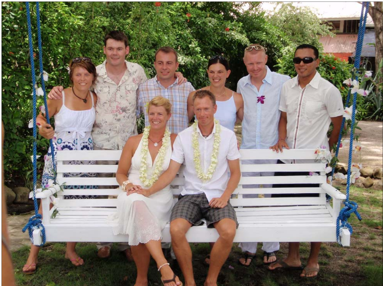
IOAPA members at the wedding party in Costa Rica:

We have moved to Costa Rica and established Bahia Rica Adventures. This is a tourist business with sports fishing, kayaking, snorkeling, boat tours and jungle walks. We are based in a small community and are only using local labor. We are at the moment working on a cooperation with the Costa Rican football league, to assist with a development initiative.