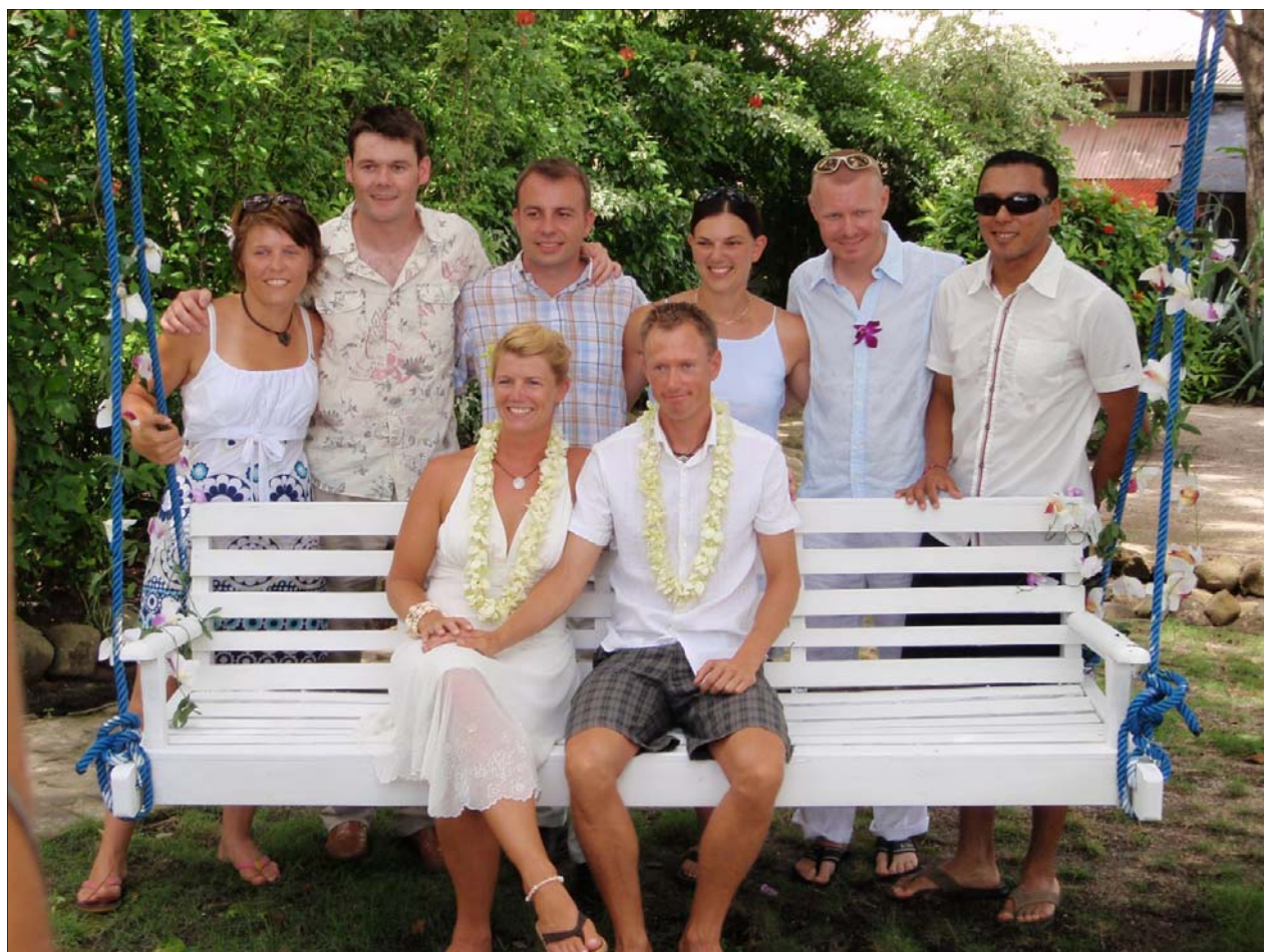
IOAPA members at the wedding party in Costa Rica:

We have moved to Costa Rica and established Bahia Rica Adventures. This is a tourist business with sports fishing, kayaking, snorkeling, boat tours and jungle walks. We are based in a small community and are only using local labor. We are at the moment working on a cooperation with the Costa Rican football league, to assist with a development initiative.