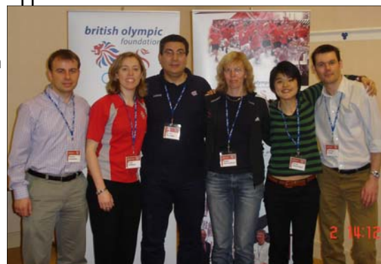
IOAPA members attending the 2008 BOA

It is also good to note that the IOAPA was well represented during this seminar and the members of the IOAPA Executive Board that were present at the seminar took the opportunity to discuss various topics in connection with the IOAPA. It is an exciting and interesting phase for the IOAPA that is reaching new heights by the sheer determination of the hard working Executive Board that was elected at the last IOAPA session in Olympia in summer 2007. Let's keep the IOAPA alive and kicking and let's spread the Olympic spirit as far as we can. The more we work within the Olympic family the better it makes us feel within.