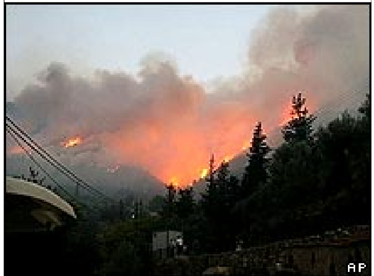
Mt. Taygetos where the IOAPA carried the Olympic flame in 1996