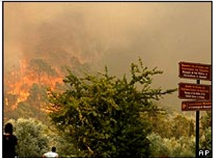
Mt. Kronos near the entrance to the Ancient site

REPRINTED WITH PERMISSION FROM THE 15 September 2007 KATHIMERINI ENGLISH EDITION ( www.ekathimerini.com )