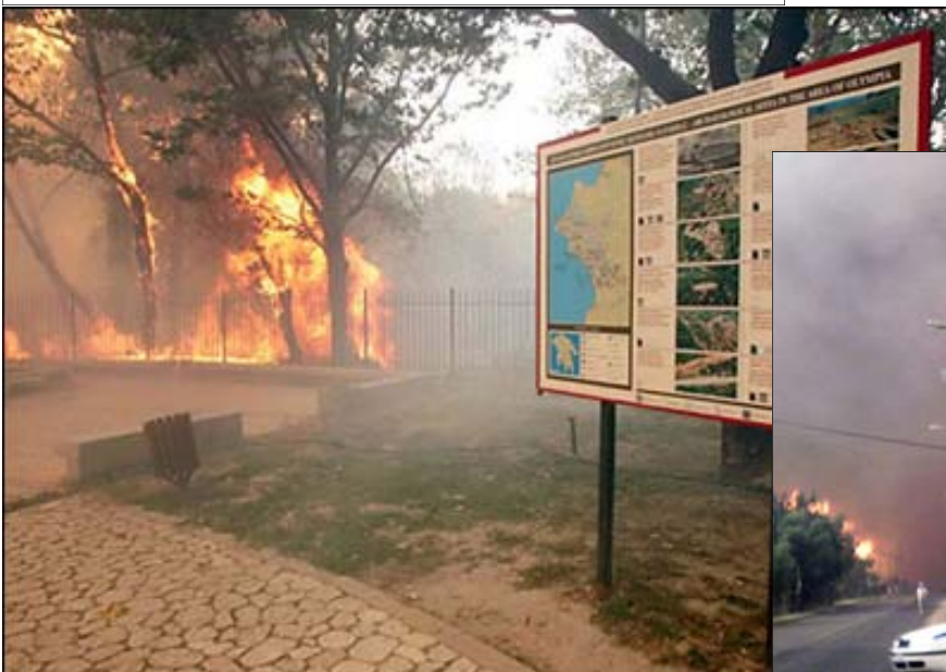
Left: The entrance to the Ancient site at Olympia.