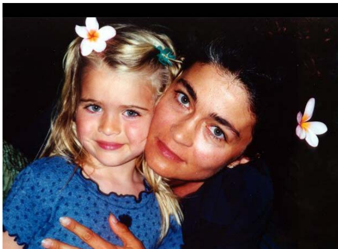
Mother and Daughter: