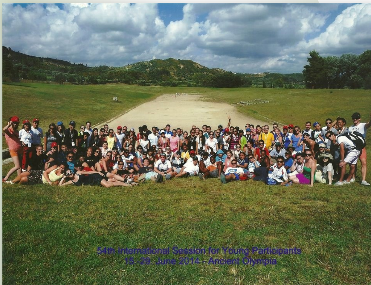
54th International Session for Young Participants 15-29 June 2014 - Ancient Olympia