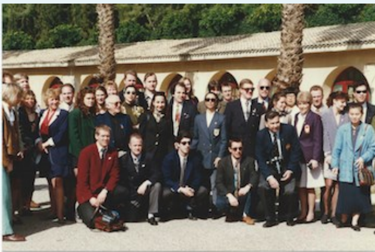
Flame Relay Delegation