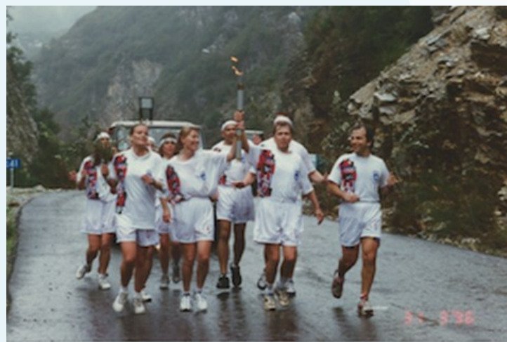
Flame Relay 1996